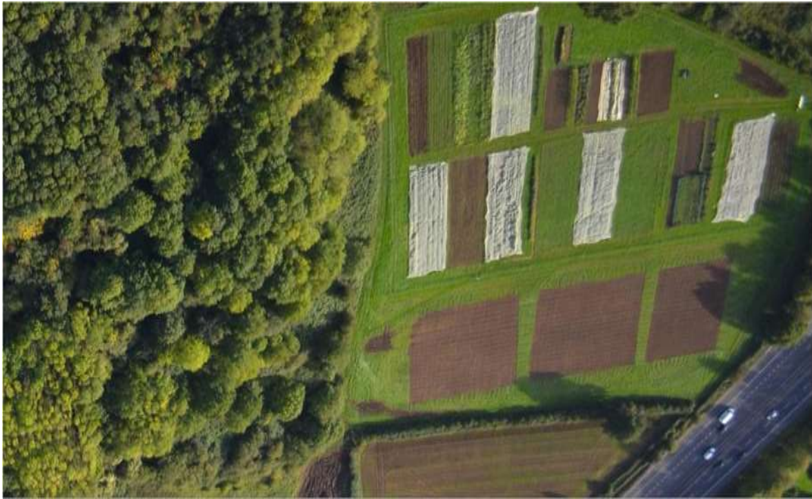
An aerial shot of Sims Hill

Sims Hill is a 6 acre field leased by Bristol City Council. The site is located on Frenchay Holdings, Stoke Lane, Frenchay, Bristol. The ordnance survey map details for the site are described here (pdf). We also have use of a large multi-span polytunnel and some associated land on the Grow Wilder site in Frenchay. You can find directions on our website - simshill.co.uk